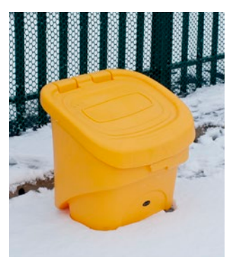
Nestor™ 90 Grit Bin