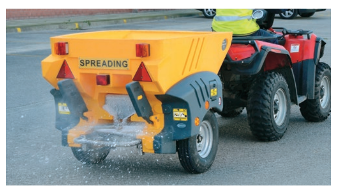
Turbocast 800<sup>™</sup> Towable Dual Action Grit/Salt Spreader