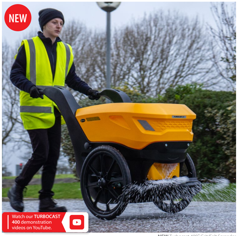
NEW Turbocast 400<sup>™</sup> Grit/Salt Spreader