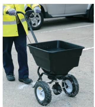
Icemaster 50<sup>™</sup> Salt Spreader