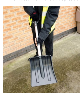
Glasdon Snospade<sup>™</sup> Snow Shovel