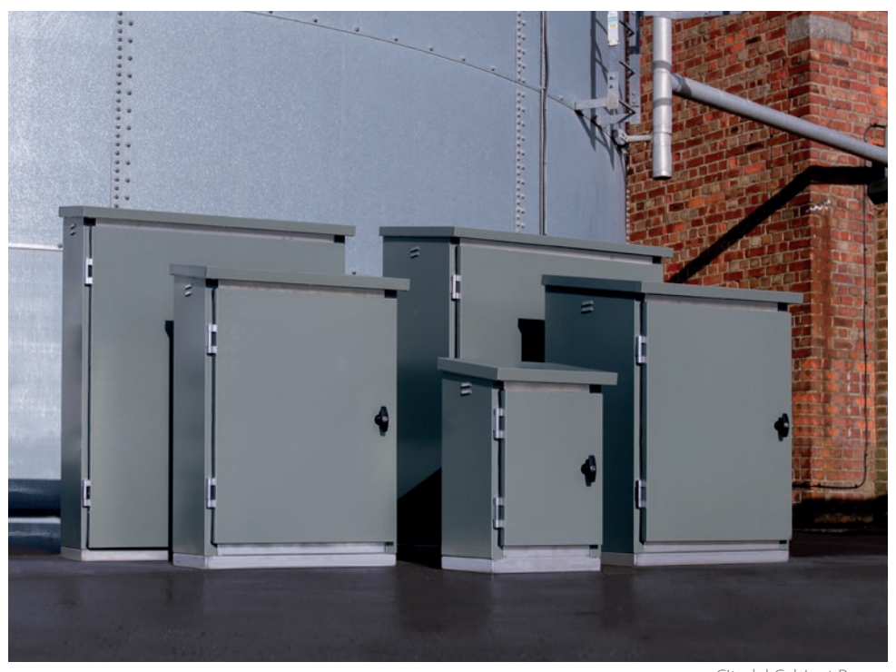
Citadel Cabinet Range

These steel cabinet enclosures offer a long term solution to house and protect instrumentation and electrical equipment. With the option of either double-skinned, insulated construction or our economical single-skin range, our cabinets have become a popular choice for metering and electrical panels.