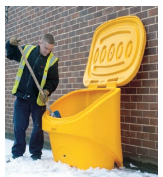
Nestor™ 400 Grit Bin