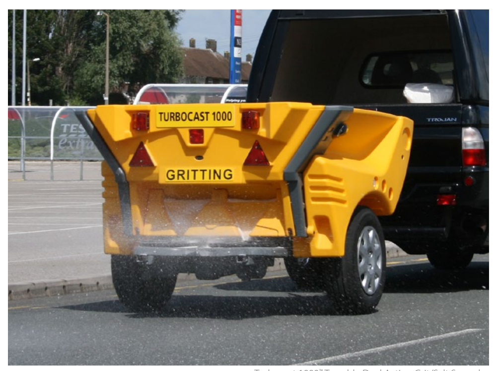
Turbocast 1000™ Towable Dual Action Grit/Salt Spreader

Reduce the risk of accidents during the colder months with Glasdon winter safety equipment. We offer storage bins for grit salt or ice melt, manual and towable spreading equipment and a wide selection of accessories to help ensure your site is prepared for ice and snow.